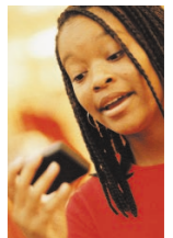
"AnyDevice is taking a broad approach, with the promise of serving up any content on literally any type of non-PC device." (Inter@ctive Week)

AnyDevice integrates its Mobile Server and Voice Server, allowing businesses to consolidate developing teams and reduce hardware/software costs.